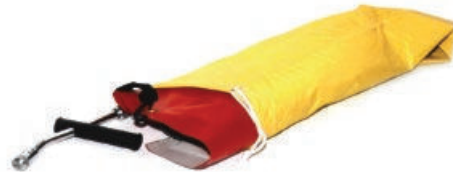
Polyamide pack for storage & transport