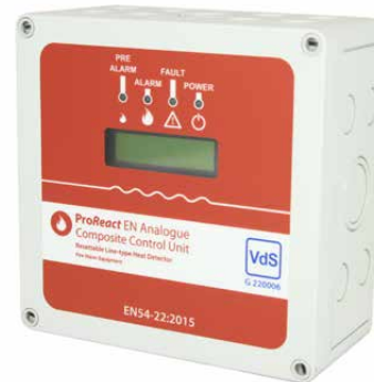
ProReact EN Analogue Composite Control Unit

More information relating to Thermocable's ProReact EN Analogue Composite Control Unit can be found in the product datasheet or installation manual, both of which are available on request.