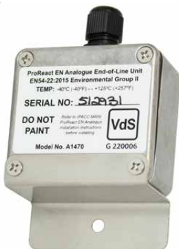
ProReact EN Analogue End-of-line Unit

The ProReact EN Analogue End-of-line Unit is compulsory in all ProReact EN Analogue LHD systems as it has a key role in the operation of the technology, allowing the control unit to detect a short circuit or open circuit in the sensor cable. It is small in size and is straightforward to be mounted on surfaces.