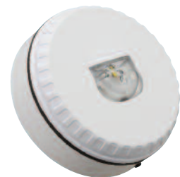
Solista LX Wall White